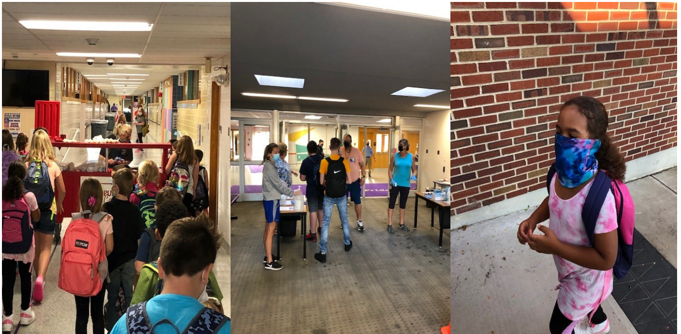
Arrival DOES look different. Masks on in common areas. Temperature screenings when students enter. Breakfast in the rooms.

On Tuesday, September 8th we welcomed back students to our campus! The Glenn Curtiss Memorial School welcomed all students in grades K-6 for a full day together. The Hammondsport Jr/Sr High welcomed two grade levels a day for the first week. The students were AMAZING and we were SO glad to have them back. Since parents and the community can't come visit us during this crazy time, we wanted to use this Laker Lines to show some pictures of what this 'new' school year looks like. We look forward to a great 20-21 school year together!