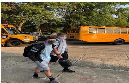
Left: The FIRST DAY!!!