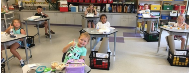
Our second graders enjoying lunch and social time in the classroom thanks to our incredible cafeteria staff!