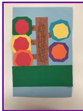
Leona - K

First grade just finished their tree project, where they learned about even more types of lines than they did in Kindergarten. These artists discussed how to repeat lines and shapes to create patterns. They were challenged with creating five of their own patterns, one for each leaf on their tree. Students also worked together during a print making exploration activity, where