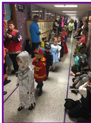
Our Pre-K students led the way!