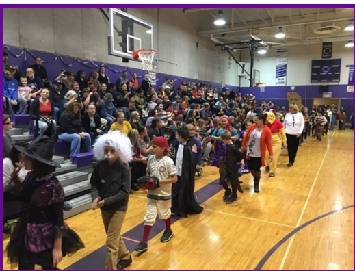
The rain didn't stop us – our families filled the high school gym to cheer on our students!