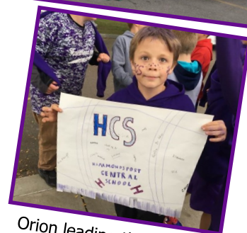
Orion leading the way for fifth grade in the parade!