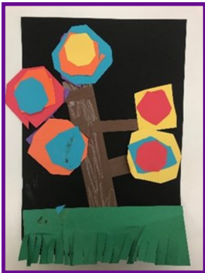
Caydance - PreK

PreK and Kindergarten started off the year learning about shapes and lines through a shape and line collage, where they designed their shapes with their choice of markers, crayons, and colored pencils. These young artists practiced their fine motor skills with these multiple drawing media, glue, and scissors, as well as learned how to use these materials safely and effectively. Each collage turned out beautifully! PreK and Kindergarten are currently learning about Kandinsky and are applying what they learned about shapes, lines, and collage while creating their Kandinsky inspired trees, as seen in Caydance and Leona's artwork.