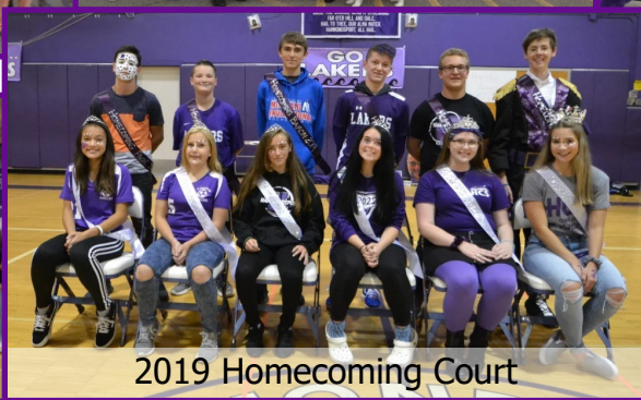
2019 Homecoming Court