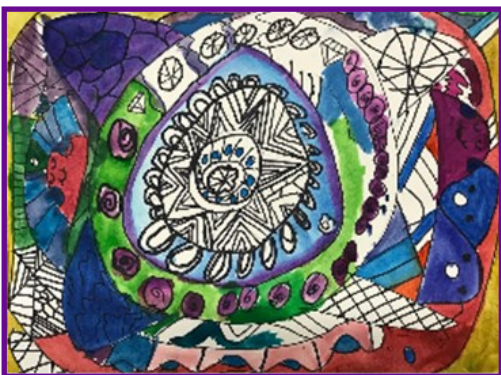
Allie – Fourth Grade

Fourth grade also started the year with a detailed, patterned dot project. They pushed themselves to create their own new patterns and then make them as detailed as possible, as seen in Allie's intricate piece. Now, our fourth graders are moving onto color mixing with a warm and cool color tree project. They will be given paints in only the primary and secondary colors and they will experiment with mixing a variety of new colors.