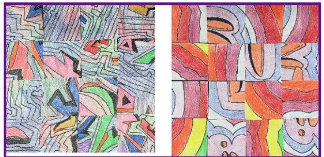
Jack (left), Olivia (right) – Sixth Grade

How it all aligns: Students at each grade level are building more skill and deepening their knowledge of color, shape, and line as they get older. This is evident in the PreK/Kindergarten and first grade trees; the foundation of shape and line is started in PreK and Kindergarten, and when students move up to first grade, they apply their knowledge of shape and line to create patterns. This vertical art curriculum can also be seen between the warm and cool color blending in our second graders' pumpkins, and our third graders' hue, tint, and shade mixing, which is more difficult and advanced.