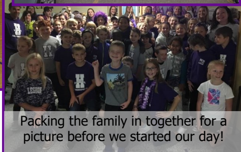
Packing the family in together for a picture before we started our day!