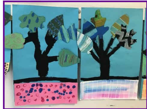
Arrah (left), Ada (right) – First Grade

they used materials like styrofoam printing plates, marker and bottle caps, dabbers, and a white oil pastel resist, to create different printed patterns on paper for their "grass". First grade is now currently learning about warm and cool colors, while creating a landscape mixed media drawing.