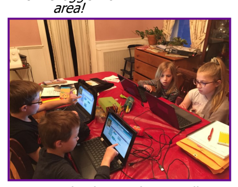
Homeschooling at the Martellos!

Light was not to be found, For the Darkness was profound; Creatures howling in the night; There was no human in sight; Children tucked in bed, Nightcaps snug on their head; Morning shall rise soon; For now the ruler was the Moon.