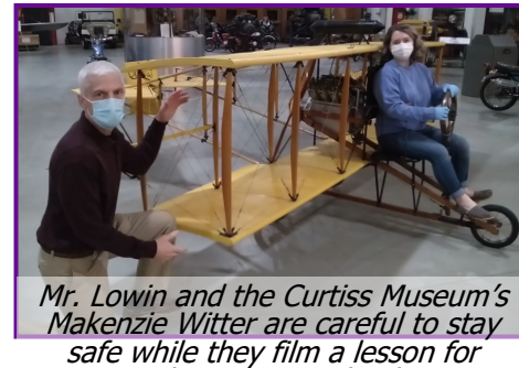
Introduction to Technology!