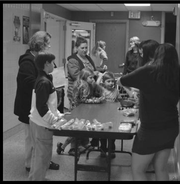
Participants decide to "Rethink their Drinks" learning about the sugar content in beverages.