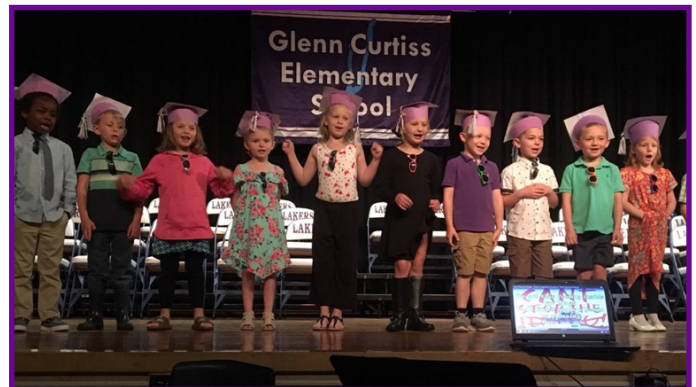
Our Kindergarten graduates performed for their families to celebrate – they're going to first grade!