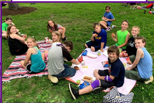
Third graders enjoy burgers and hot dogs cooked out by our cafeteria staff!