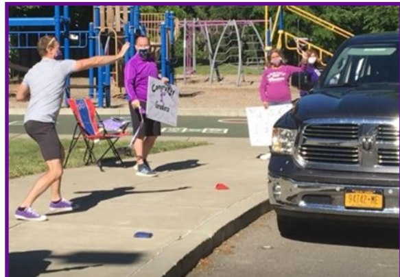
First and second grade all smiles seeing our kids!