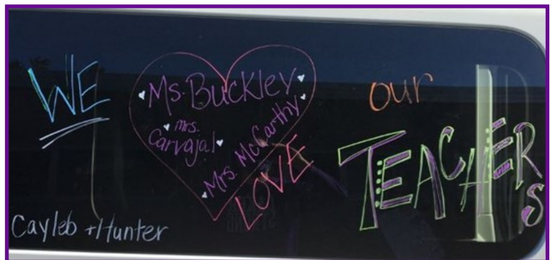
Many of our families decorated their cars to celebrate our amazing teachers!

On Monday, June 15th, our staff gathered in groups of no more than 10 throughout the day to wave goodbye to our families in our front bus loop. Social distancing guidelines and lots of smiles and laughter were in place throughout the day! Thank you to our families who were able to join us and feel the special bond we have between staff, students, and families one final time before the official start of summer!