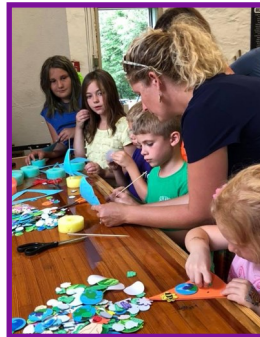
Lakers creating their own boats at the Boating Museum!