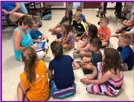
Students enjoying a story at the school!