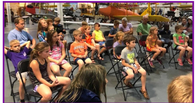
Students listening to a motorcycle story at the Curtiss Museum!