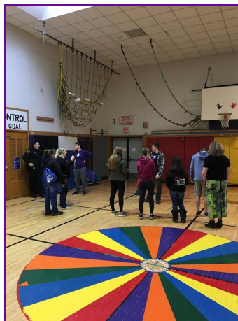
Steuben County Sheriffs with Hammondspport Juniors and Seniors

On March 29th, to coincide with the Junior Prom, which will be held at Logan Ridge on April 7th, and The Class of 2018 Graduation scheduled for June 22nd, the Steuben County Prevention Coalition and Steuben County Sheriff's Office presented a safety program to our entire junior and senior classes. Students heard first-hand about the impact of impaired driving from victim's family member and took part in simulations and lessons on the legal implications of poor decision making. Stations and simulations for the event included an impaired driving kart, mock field