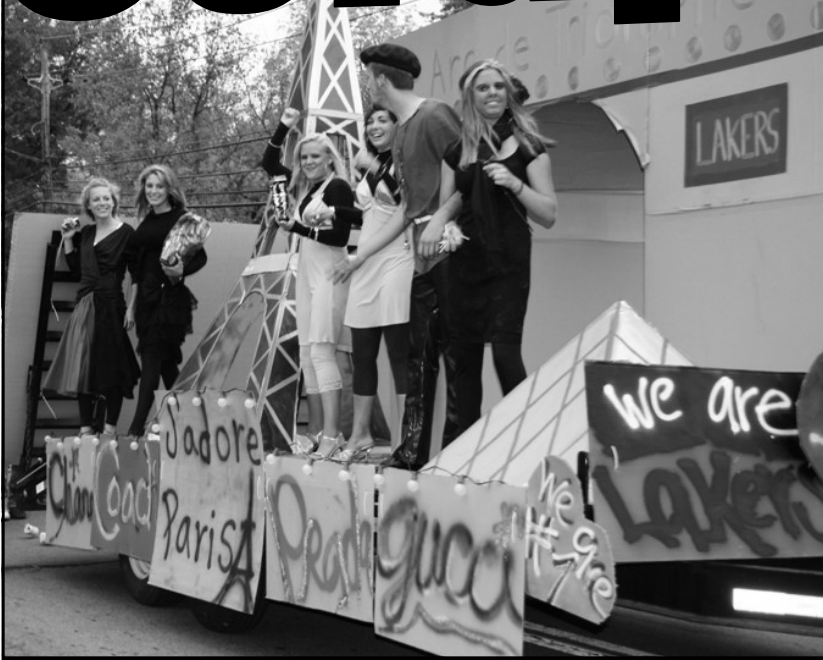
The Senior Class float, which took home first place honors, depicted Paris featuring the Arc de Triomphe and the Eiffel Tower