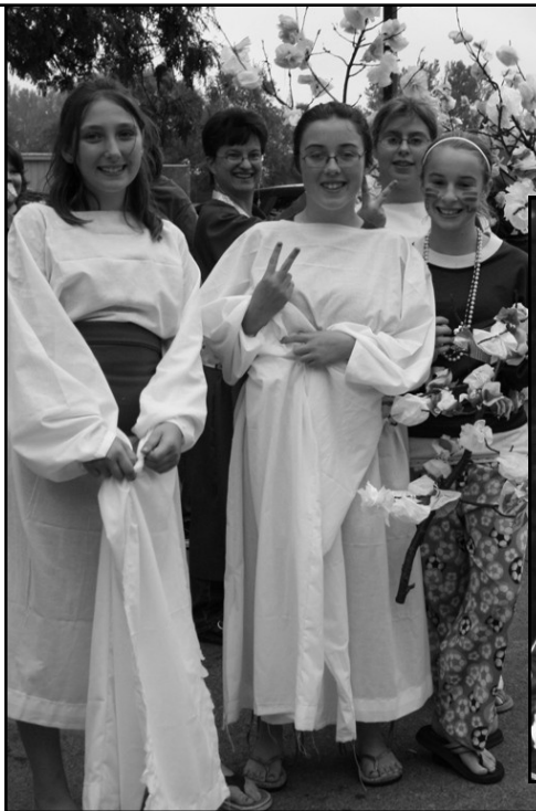
It's a peaceful greeting from these Seventh Grade students representing Tokyo, Japan

As always, many thanks to the PTO for sponsoring the children's games after the parade and to the Legion for providing free hot dogs to the HCS community.