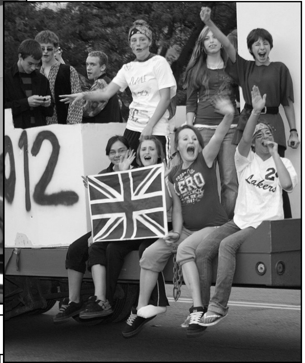
These Freshmen Londoners seem to be going a little crazy. Is that because they had a Beatles sighting?

It was a Tale of Six Cities for the 2008 Homecoming Parade. From Washington, D.C. to Beijing, classes depicted some of the more famous cities around the world in their Homecoming floats. Félicitations to the Seniors for winning first place for their Parisian float.