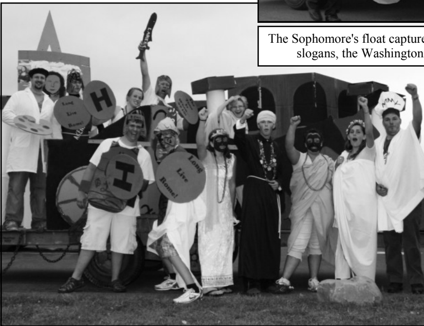
“Long Live Rome!” say these gladiator clad Juniors posing in front of the Roman Colosseum