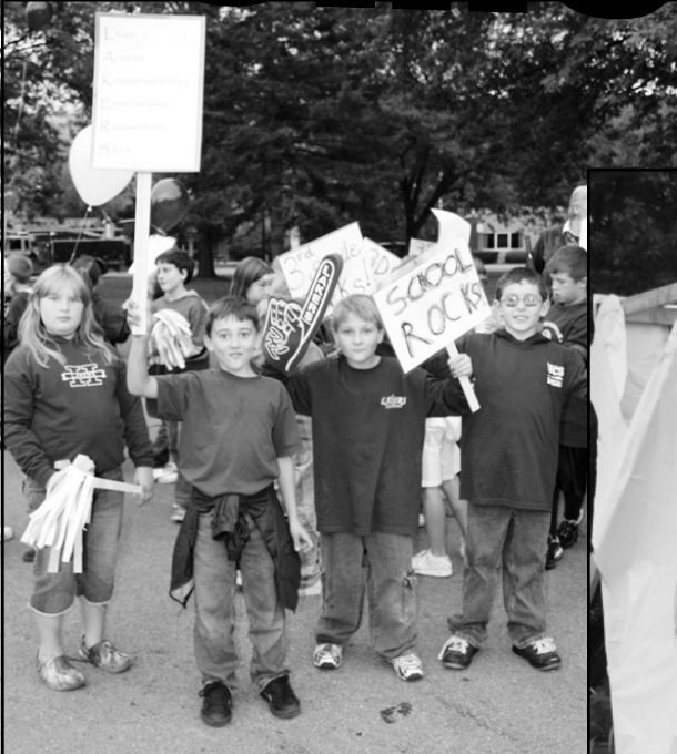
“School Rocks” and “Lakers Are #1” according to these Elementary students. They may be young, but they have an advanced degree in school spirit.