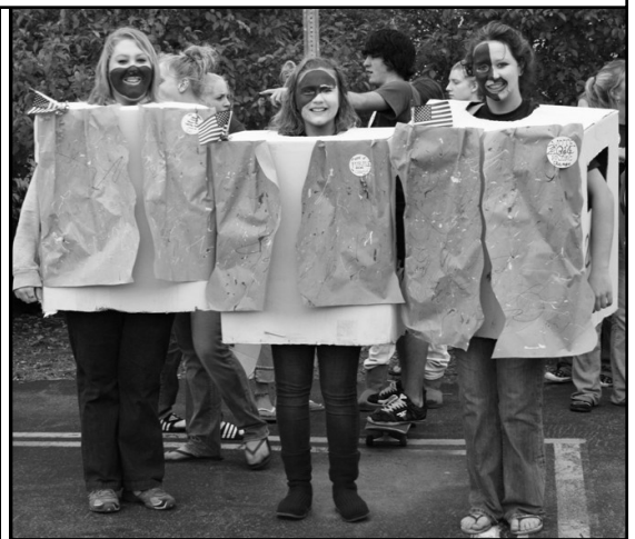
These ballot boxes were hoping the judges would cast their vote for the Class of 2011 float.