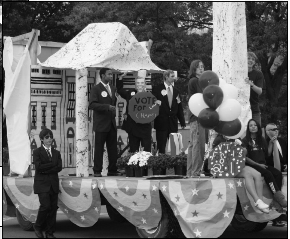
The Sophomore's float captured our nation's capital with some popular campaign slogans, the Washington monument and even some secret servicemen.